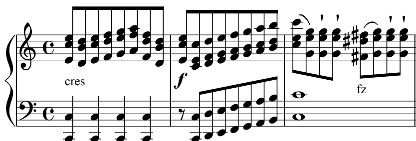
Example 3: Clementi, Opus 33 no. 3, Allegro con Spirito, bars 20-22

The third sonata of Opus 33 is a transcription of Clementi's only extant piano concerto, in C major. Remarkably virtuosic in style, the skills required to perform this sonata are striking, such as the pianist's ability to play long passages of filled octaves [Example 3]. Clementi developed his use of scales in thirds to include a doubling of the octave, which demands of the pianist both prolonged physical stamina and a firmly sculpted hand position.